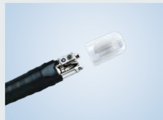
Duodenoscope with a removable distal-end cover

clarification to the instructions for use. Over 2,200 customer training in-services have been performed in the United States to educate customers and promote safe reprocessing practices.