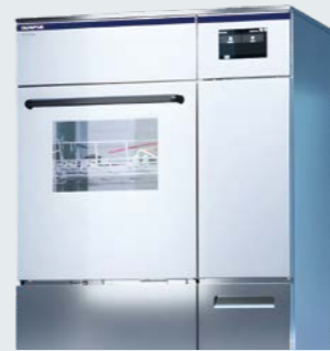
Automatic Endoscope Reprocessor launched in EMEA

Olympus' Infection Prevention Business strives to increase patient safety, provide economically and environmentally sustainable reprocessing solutions as well as pursue untapped organic and inorganic opportunities. Topline growth is driven by a holistic portfolio globally led by the Automatic Endoscope Reprocessor (AER) launches and their consumables.