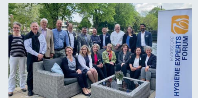
Participants of the Endoscope Hygiene Experts Forum (EHEF)

Looking ahead, we confirm our commitment to shaping the infection prevention landscape and driving innovation with patient safety at the forefront of all our efforts.